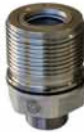
Screw type couplings series CH