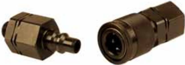
High pressure couplings series HP